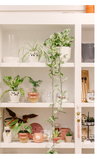
under fluorescent lights