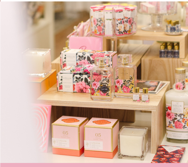
paris morning bright

Unzip or decompress the ATG Presets folder that came with this PDF. Open the folder, select all .Irtemplate files, and drag over your Lightroom icon. When prompted to develop presets, select "OK" or "Yes." Restart Lightroom, and the presets should appear! (Still need help? Skip to last page!)