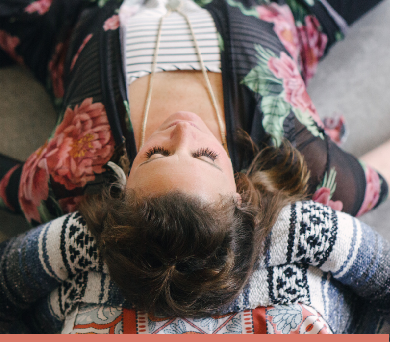
paris morning bright