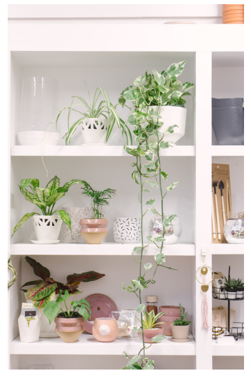
paris morning bright