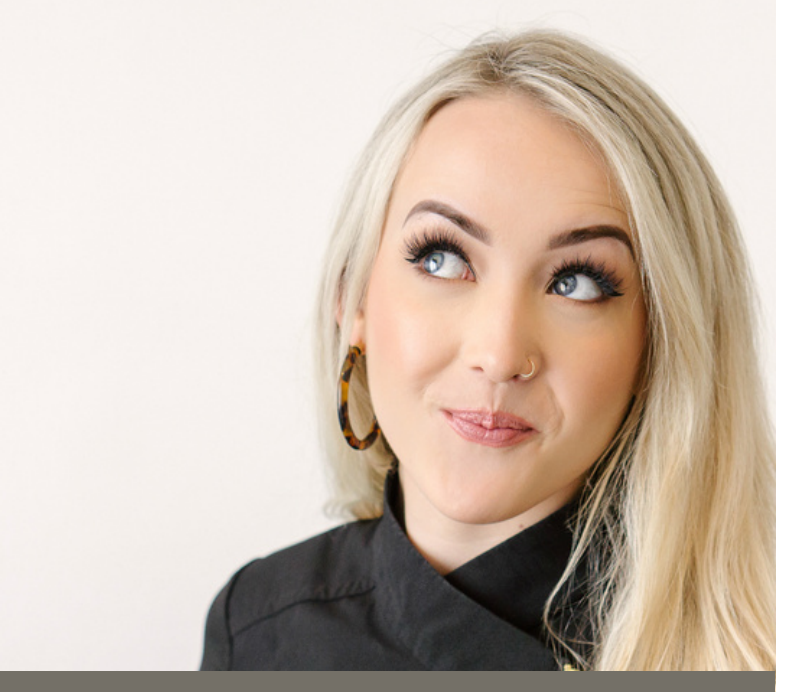
paris morning bright